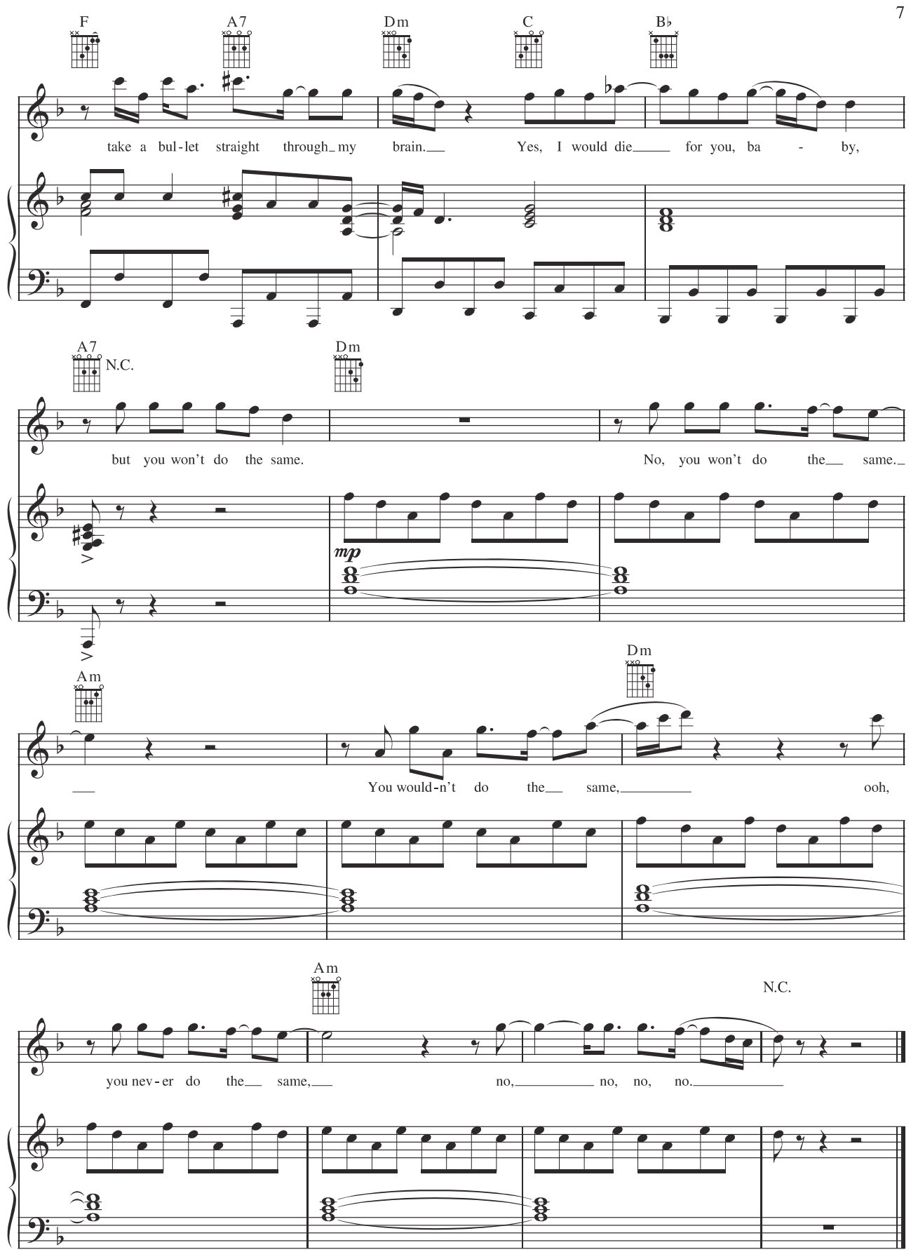
Grenade - 6 - 6