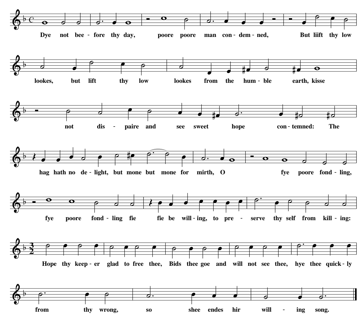
Notes: Original clef C on first line

ne Second Booke of songs or Ayres of 2/4/ amd 5/parts: with Tableture for the Lute or orpherian, with the Violl de Gamba.)